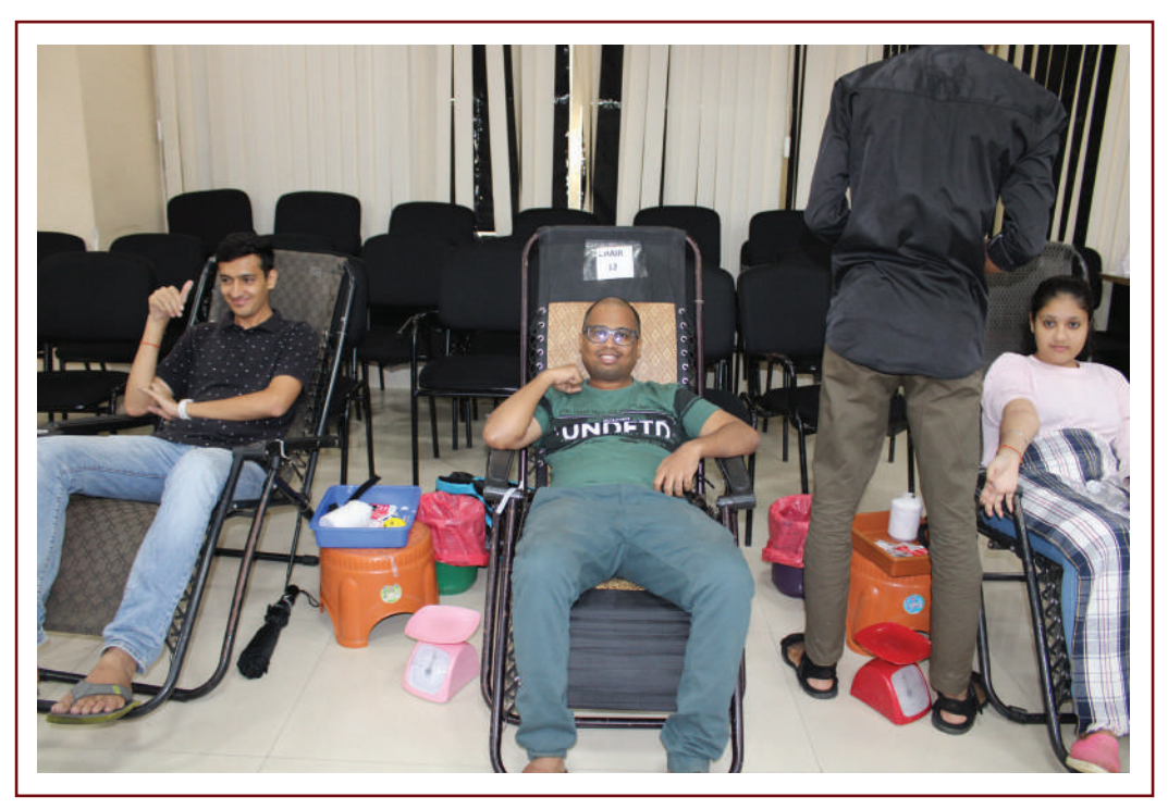
Participants at Blood Donation Camp