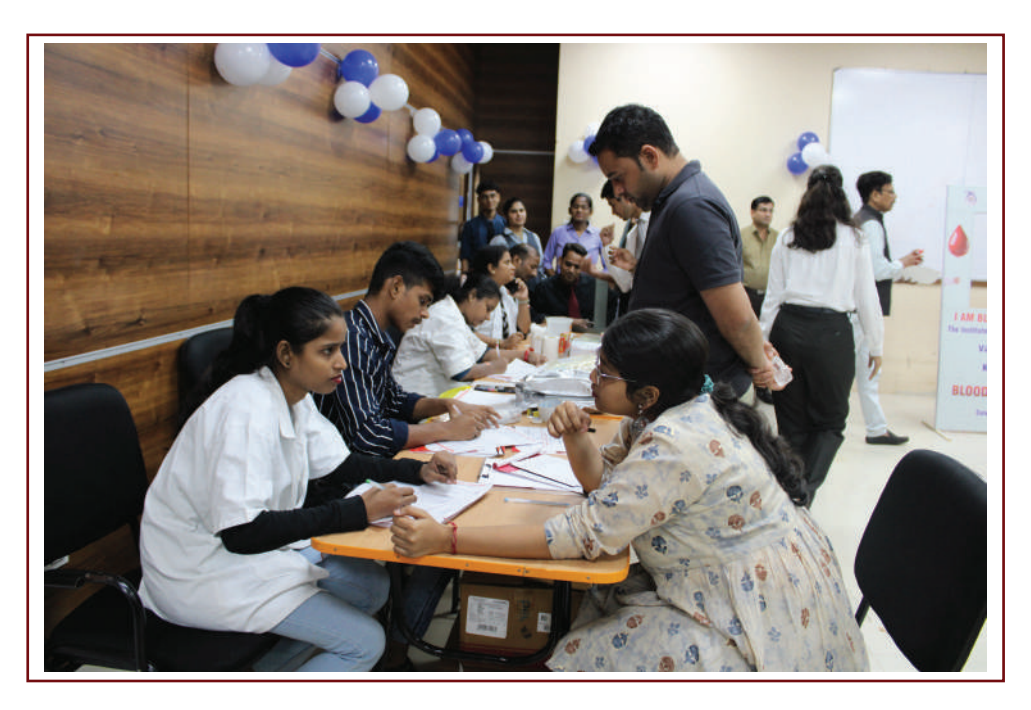
Our exceptional team of doctors tirelessly worked to ensure the success of our Blood Donation Drive.